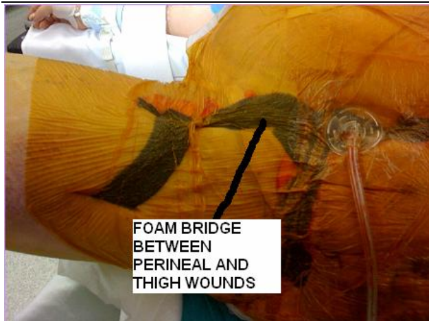
Figure 2. Foam bridge connection between non-contiguous surgical sites distributes negative pressure suction.

A return to the operating room the next day revealed purulence in the inguinal canal. Further debridement was done, the VAC was once again successfully re-applied, and she returned to the SICU. Despite aggressive therapy, the patient eventually succumbed to multiple organ failure. Details of our VAC application technique are described below.