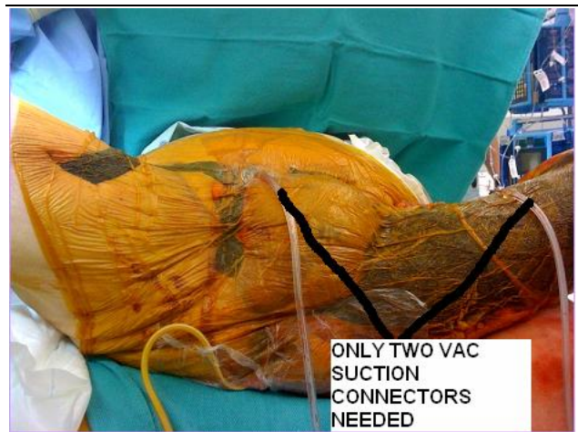
Figure 3. Despite extensive wounds, bridge therapy can limit the number of connectors necessary for negative pressure wound closure.

The wound VAC has been shown to have a number of advantages for wound care. The watertight arrangement simplifies wound care and prevents drainage onto unaffected areas. Infected fluid is continually drained from the wound bed, allowing the VAC dressing to be changed less frequently, such as every two or three days. Because the dressing is less cumbersome and bulky, the VAC facilitates early ambulation. 3